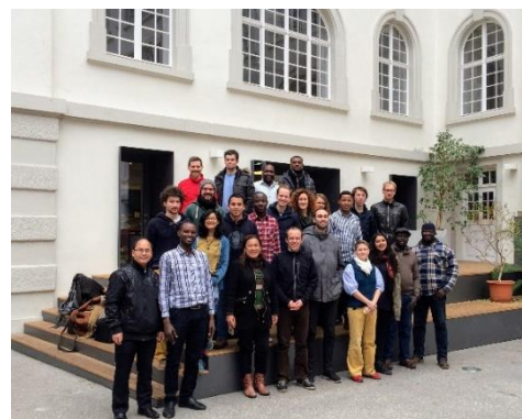
Participants of the Carbon Forestry course 2018.

Email: carbon.forestry@waldbau.uni-freiburg.de Phone: +49 761 203 - 8606 Fax: +49 761 203 - 3781